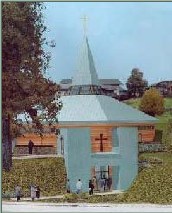
A rendering of the new Village Baptist Church, Marin City. It was completely gutted by a devastating fire.